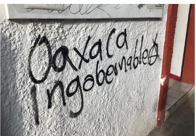
"¡Vivan los auto-gobiernos comunitarios!" "Long live the communitarian self-governments!"

These are but a few of the pieces of graffiti that cover the walls of downtown Oaxaca City. Even knowing Oaxaca's reputation as a simmering cauldron of revolt from my previous visit in 2014 did not adequately prepare me for the ubiquity and intensity of the anti-capitalist and anti-authoritarian sentiments that manifest in the public spaces of its capitol, defiantly